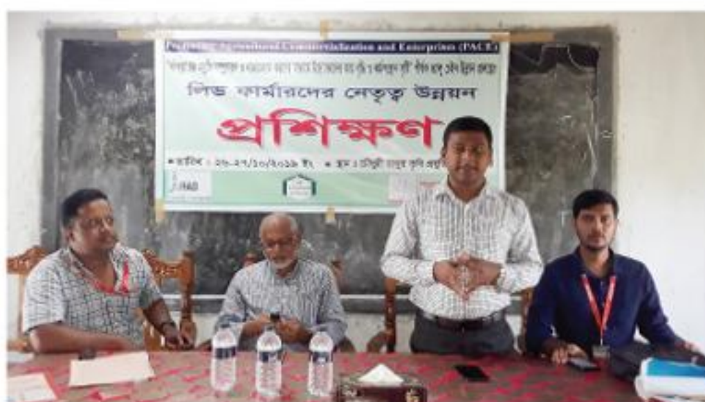
Training program on Crab Culture opened by Fishery Officer, Pathorghata

Donor: International Fund for Agriculture Development (IFAD)