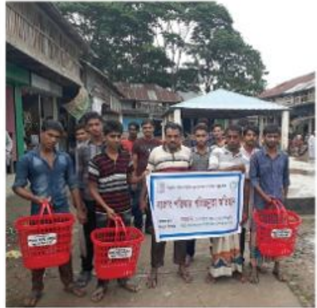
Cleanliness program at pathorghata

1. Health and Nutrition 2. Education 3. Family Development Planning 4. Financial Support 5. Special savings 6. Training on IGAs