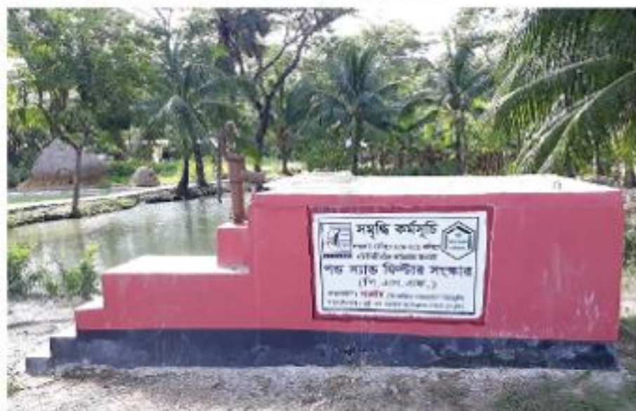
Pond Sand Filter Reconstruction under Enrich Program at Pathorghata Union

PKSF has started ENRICH project patronizing different livelihood related activities like education, health and nutrition, human resources development with economic support in large sense of poverty alleviation. Members of this project learn how to make best uses of local resources and their capacity. SANGRAM has been implementing this program in Pathorghata sadar union of Pathorghata upazila and Dowatola u nion of Bamna upazila.