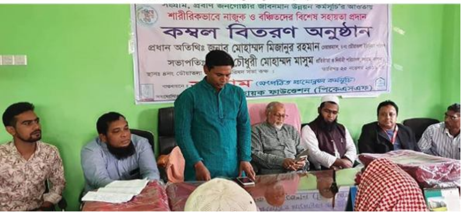
Blankets distribution among the geriatric people