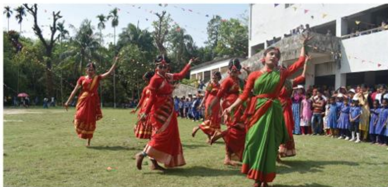
Cultural events under this program

Inspiration of sportsman spirit forms a healthy nation. The events of sports programme includes Cabady, Badminton, Foot Ball, Swimming, Volley Ball, Table Tennis, Chess, Carambole, Hand Ball, Mini Marathon, Cricket, Young-Old get together and Charity Matches.