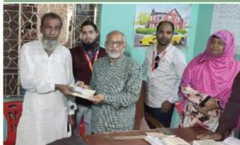
Loan Giving Ceremony of potato farmers