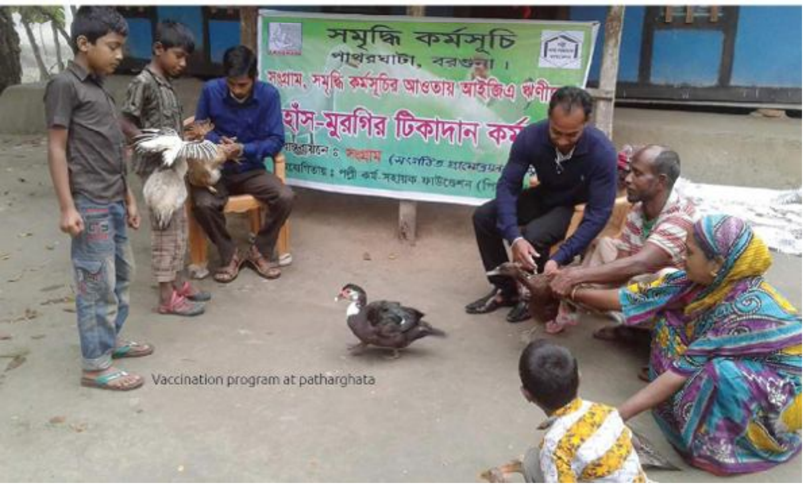
Vaccination program at pathorghata

7. Youth Development 8. Solar Panel 9. Improve Cooking Stoves 10. HHs based Sanitation and Hand Wash 11. Medicinal Plant (Bashok) Cultivation 12. Homestead Gardening 13. Vermin Composting 14. Beggars Rehabilitation 15. Community Based Interventions 16. Samridhi Bari 17. Youth in Development 18. Disability Activities.