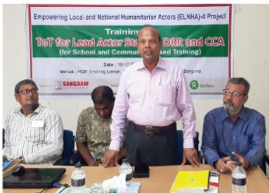
Training Program opened by DEO under ELNHA-II